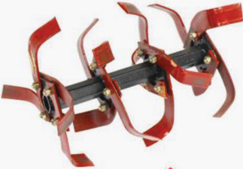
Normal cutter Thickness:4.5mm