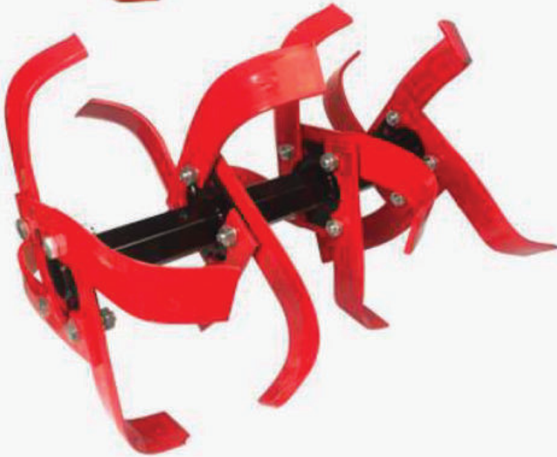
Thickening cutter Thickness: 6.0mm